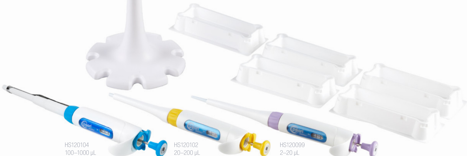
HS120104 100–1000 µL